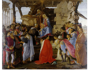
Adoration of the Magi